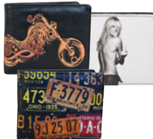
Shag Wear Wallets - Retro inspired wallets crafted from polyurethane foam and secures with a magnetic snap button. $26.99 ea.