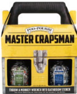
Master Crapsman by Poo-Pourri - For the handyman in your life! Trap-A-Crap and Royal Flush scents. $32.99 ea.