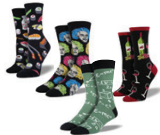
Socksmith - Designed with love in Santa Cruz, CA. Show some personality! Showing Einstein, Math, Sushi, & Wine. Many more in store. $19.99 pair