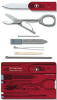
Swiss Card - By Victorinox, the makers of the original Swiss Army Knife. As thin as a credit card! $47.99 ea.