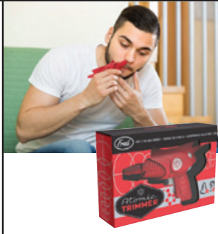
Atomic Trimmer - Pull the trigger and stand back as unwanted nose and ear hair gets blasted away! $22.99 ea.