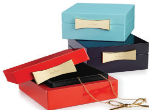
Garden Drive Jewelry Boxes