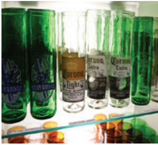
Artech Beer Glasses - Upcycled from original beer bottles! Holds a full beer, Redstripe, Corona, Sleemans just to name a few. $22.99 ea.