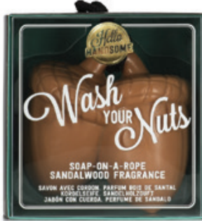
Wash Your Nuts - Soap On A Rope! Everyone could use a reminder. 😊 $14.99 ea.