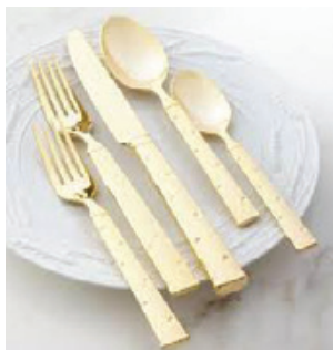
Larabee Dot Gold Flatware