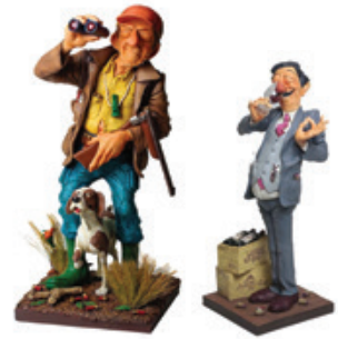
Guillermo Forchino - Designed in Pairs! A collection of comic sculptures, hand painted with an extra touch of realism. From $129.99