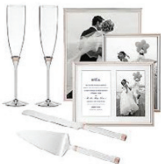
Rosy Glow Collection