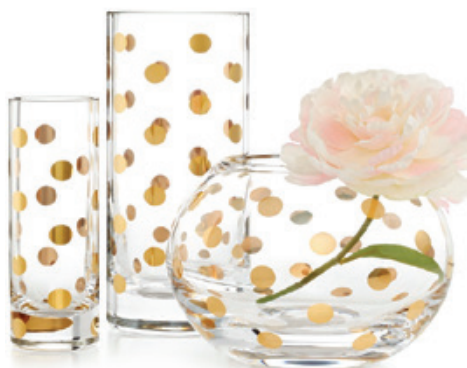
Pearl Place Collection