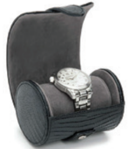
Watch Roll By Wolf - Luxurious leather. A classic gentleman's travel necessity with a bit of flair. One to stow and one to go. $89.99 ea.