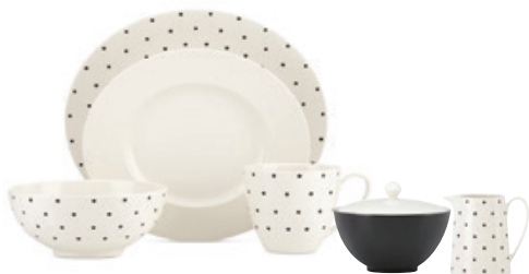
Larabee Dot Dinnerware - Also available in Grey and Navy

Five Small Rooms features the entire kate spade giftware collection. Each piece is designed to add an extra-special touch to your favorite space. Be it china splashed with hand drawn stripes, polka dots or a vase crafted from thick cut crystal. Make whatever you choose make each day extraordinary!